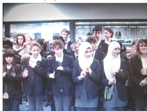
Tutor Group NQL "Signing" to "With a Little Help From My Friends"